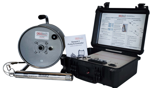
Geotech Geosub 2 & Controller