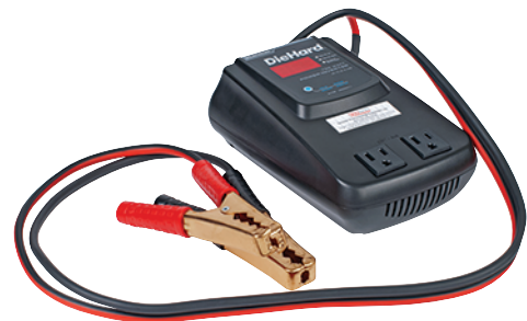
Optional DC to AC Inverter